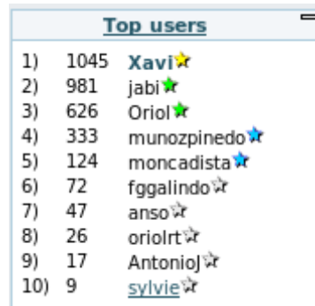
Module users_rank from scores

This feature is a game to motivate people to participate in the community. Users are given points for things they do in the site, like writing an article, reading an article, starting a new topic in forum, voting a poll, etc. They also earn points by being popular, like having his/her blogs and articles read and commented. Then the users will be able to see their position in a ranking.